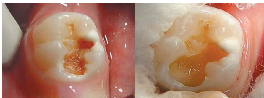
Figure 2- Clinical aspect of cavity before and after removal of carious tissue with chemo-mechanical caries removal

The time required to perform the procedure was measured in minutes and seconds using a digital chronometer (Kenko®).