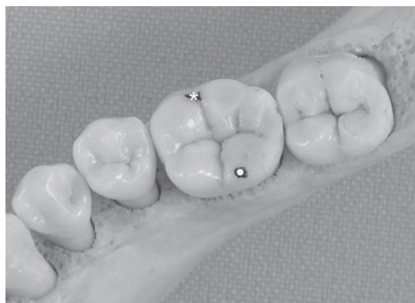
Figure 1- Occlusal surface of the mandibular permanent first molar Mesiobuccal groove (*) and middle point of the mesial slope of the distolingual cusp (●).

1. Locate the mesiobuccal groove and middle point of the mesial slope of the distolingual cusp of the primary second molar or permanent first molar (Figure 1). 2. The first wire must pass through the mesiobuccal groove and middle point of the mesial slope of the distolingual cusp of the primary second molar or permanent first molar (Figure 2). 3. The second wire must follow the occlusal plane on the left side (Figure 3).