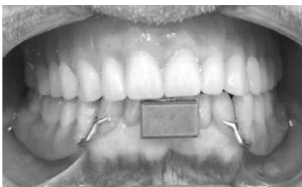
FIGURE 2- Magnet affixed in the patient's labial vestibule.

level. The mean value of interocclusal distance before the new prosthesis insertion (T0) was then compared with those recorded after several times of prosthesis insertion (T1, T2, T3, T4, T5, T6, T7, T8, T9 and T10) using a paired t test, at the same level of confidence.