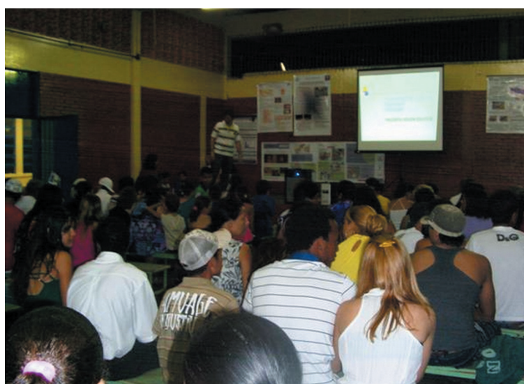
Figure 3- Production chain in health, knowledge and value hierarchy of the university to the community