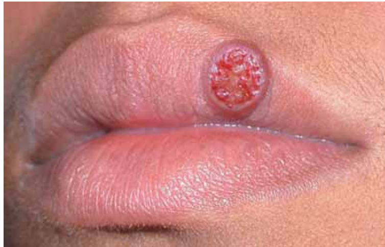
Figure 1- Reddish-yellow, ulcerated, superficial nodule involving the mucocutaneous line of the upper lip

The nodule was removed by excisional biopsy (Figure 2). Microscopic analysis showed an oral mucosa consisting of continuous, parakeratinized, stratified pavement epithelium covered with