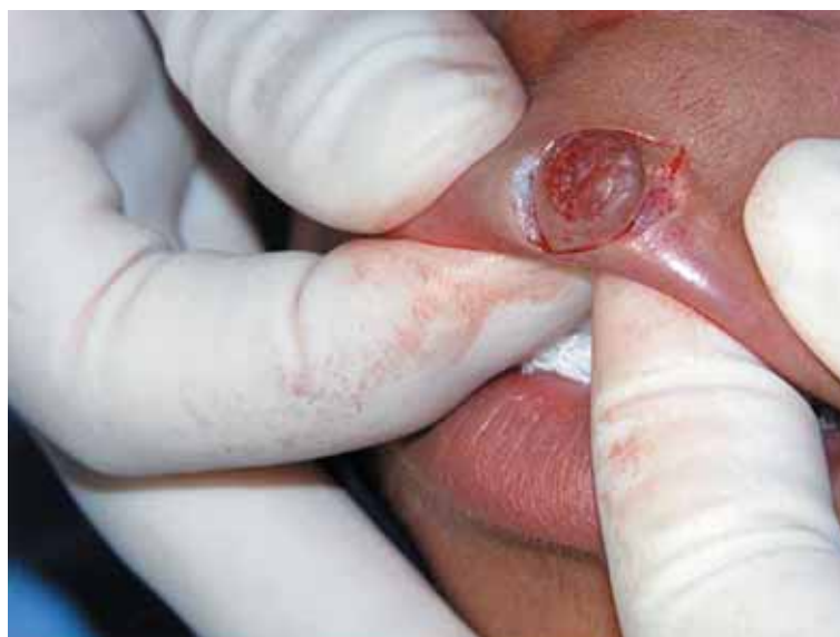
Figure 2- Excisional biopsy to remove the nodule