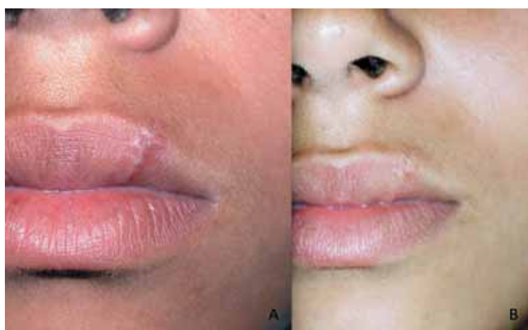
Figure 4- Labial aspect 6 months (A) and 4 years (B) postoperatively

Treponema pallidum is the etiological agent of syphilis, a chronic, sexually transmitted disease of universal incidence that can affect various organs and systems, including the mouth, which is one of the main extragenital sites of syphilis. Oral primary syphilis manifests as a deep solitary ulcer with a red or brown base and irregular border usually located on the upper lip. The disease is followed by cervical lymphadenopathy, which is observed 1 to 3 weeks after acquisition of the infection. The condition might be confused with other solitary ulcerated lesions, especially traumatic lesions. Diagnosis of primary syphilis is made analyzing