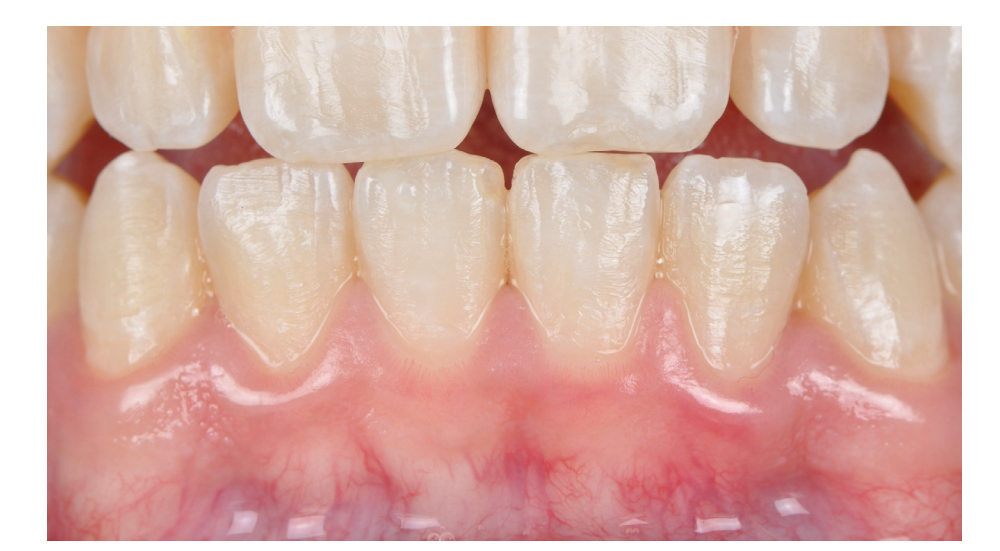
Figure 3- Appearance of gingival irritation in a patient subjected to 6% hydrogen peroxide bleaching gel during in-office bleaching. Despite the nearly imperceptible nature of gingival irritation, the patient reported experiencing irritation in the gingival area below teeth #31 and 41

*Mc Nemar test (p=1.0); Spearman's correlation between paired data (r=0.75; p-value <0.001).