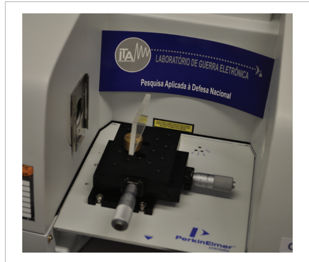
Figure 3. Canopy sample inside the spectrometer in order to perform the measurements.

As seen in Fig. 4, the canopy presents a high transmittance, from the initial wavelength (0.67 \mu\text{m} ) up to 1.6 \mu\text{m} with some absorption valleys around 1.19 and 1.4 \mu\text{m} .