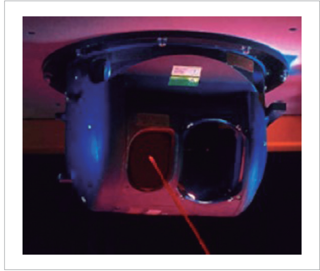
Figure 2. AN/AAQ-24(V) NEMESIS, from Northrop-Grumman.

In order to analyze the emission of a directional DIRCM, it must be considered the main characteristics of a laser beam, such as: high spectral and spatial power density, high directivity, low operating power, low bandwidth beam, and pulse operation.