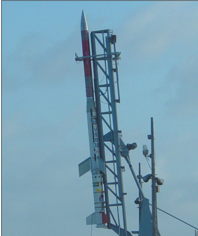
Figure 2. Vehicle Survey Booster – 30 .