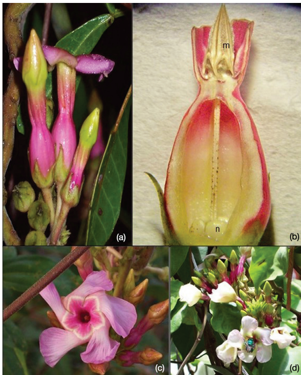
Figure 2. Flowers of Temnadenia odorifera . (a) Side view of corolla tube; (b) inferior tube of corolla longitudinally sectioned (n: nectary, m: anthers); (c) landing platform formed by the base of the lobes; and (d) inflorescence with flowers closed after anthesis and a Euglossini bee visiting the flower.

probably located on the inside of the corolla tube and on the landing platform, where the tissues are stained with neutral red. The nectary is a pentalocular disc located around the ovary, and the nectar produced accumulates at the base of the corolla tube. The overall sugar concentration of the nectar is 35 \pm 2.35\% (29–39%, n = 120 ). The flowers were most visited by Euglossini bee (Figure 2d) males and females only for collecting nectar, by Lepidoptera and, eventually, by hummingbirds. The period of greatest visitation of bees and Lepidoptera was in the first 5 h of the anthesis, and it decreased greatly in the afternoon. The rare visits of hummingbirds were always at midday.