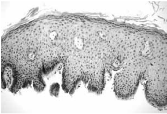
FIGURE 2 – Squamous mucosa of the uterine cervix with hyperpigmentation of basal layer cells without increase in melanocytes (HE, 100×) HE: hematoxylin and eosin.