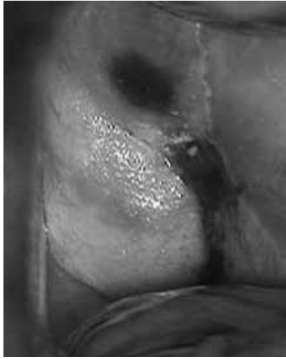
FIGURE 1 – Colposcopy showing pigmented lesion on the anterior lip of the uterine cervix (16×)