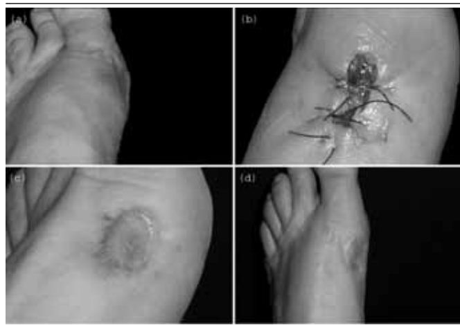
FIGURE 1 – Wound progression

Fifteen days after the initial wound, the patient developed a small asymptomatic papule on the site. Two months afterwards, after trekking with sneakers, the lesion volume increased considerably, presenting a painful swollen erythematous nodule ( Figure 1 ). Shortly after the onset of these symptoms, a traumatologist raised the diagnostic hypothesis of bursitis and prescribed applying ice to the affected region concomitantly with the use of a non-steroid anti-inflammatory drug orally. The clinical progression is illustrated in Figure 1.