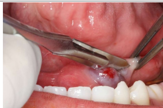
FIGURE 2 – Performing a surgical procedure, with the purpose of marsupialization of the lesion and removal of tissue (biopsy) for histopathological analysis