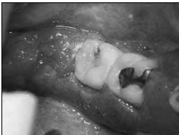
Figure 1 – Exophytic lesion with lobulated area located in retromolar region of the mandible