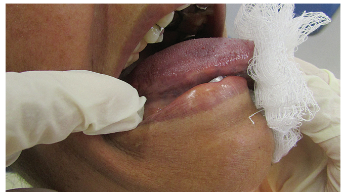
FIGURE 3 – Clinical follow-up of the patient after two years of treatment: aspect of the lateral border of tongue, intact, without presence of lesion relapse