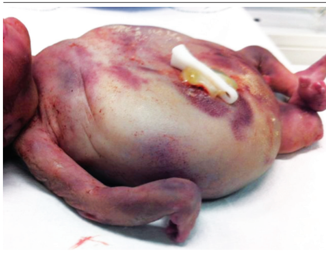
FIGURE 3 – Postnatal physical aspect of the infant showing significant distension of the abdomen and upper and lower limb abnormalities

LUTO comprises a heterogeneous group of pathologies associated with early-onset severe oligohydramnios. Chromosomal abnormalities associated with LUTO include Down syndrome (trisomy 21) and Edwards syndrome (trisomy 18) (1-3) . Posterior urethral valve (PUV) is considered one of the most common causes of LUTO. PUV can be defined as the presence of membranes that obstruct the urethral lumen, leading to urinary retention and renal damage. It presents an incidence of 1 for every 5,000 to 8,000 live male births. The severity and degree of obstruction caused by PUV depends on the relation between the membrane and the urethra. Prenatal diagnosis