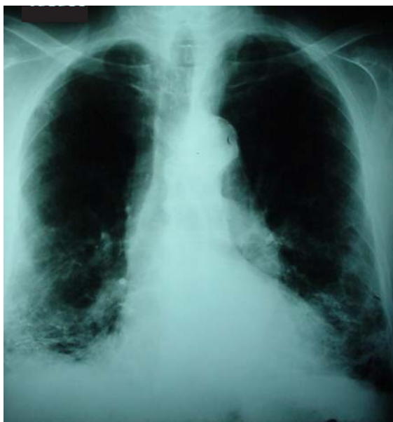
Figure 1 - Chest X-ray with retractile interstitial infiltrate in the lung bases and diffuse increase in pulmonary transparency in the upper and middle lobes. Enlarged cardiac region and an aorta affected by ectasia and atheromatosis

The patient was submitted to fiberoptic bronchoscopy, which was suspended due to desaturation of the patient, and transbronchial biopsy was not performed. The culture of the bronchoalveolar lavage fluid was negative for acid-fast bacilli. The patient was then submitted to an open lung biopsy, which revealed acute interstitial fibrosis, without histological patterns of usual or nonspecific interstitial pneumonia, as well as dendriform pulmonary ossification (Figure 3).