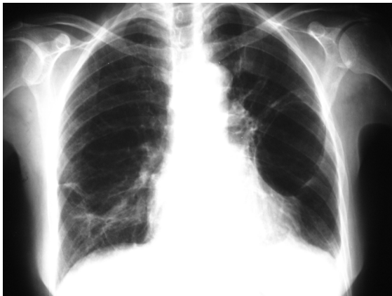
Figure 3 - Chest X-ray after one week treatment, no longer showing the areas of consolidation or the linear, heterogeneous opacities in the right lung base. Although the cystic image (pneumatocele) is still visible in the left hemithorax, it was not observed on subsequent chest X-rays.

The patient presented acute respiratory failure accompanied by bilateral pulmonary consolidations,