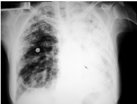
Figure 1 - Initial chest X-ray. Extensive areas of consolidation, involving the entire left lung and presenting predominantly peripheral distribution in the right lung.

The patient was initially treated for severe community-acquired pneumonia, with antibiotic