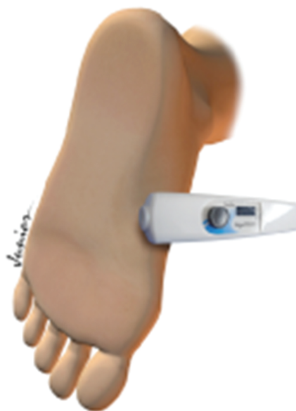
Figure 2 – Measurement of the intensity of plantar sweating.