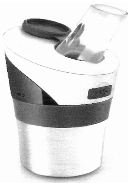
Figure 2 – Photograph of the latest-generation X-halo ® device with a frontal USB port and interchangeable mouthpiece. The bottom part can be unscrewed for cleaning after each measurement. The mouthpiece glows green when the device is ready for use.

The patients were also submitted to specific anamnesis. After the patients had given written informed consent, EBT was measured, and a pulmonary function test was performed with a MicroDL spirometer (Micro Medical Ltd., Kent, United Kingdom) and the program Spida 5 (Micro Medical Ltd.), the patients being in the orthostatic position and using a nose clip. We evaluated FEV 1 , which was expressed as the percentage of the predicted value for gender and age in accordance with the guidelines of