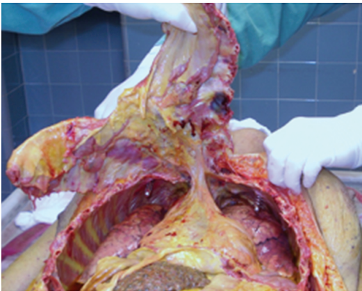
Figure 1 - Resection of the anterior ribs.

Table 1 shows that the mean weight of the operated cadavers was 68.6 \pm 2.1 kg, and the median weight was 66.5 kg. The mean height was 1.70 \pm 0.02 m, and the median height was 1.70 m. The mean posteroanterior diameter of the chest was 29.4 \pm 2.8 cm, and the median