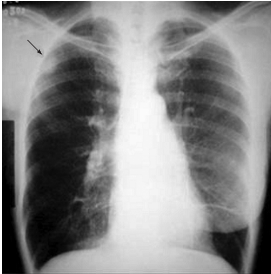
Figure 1 – Simple anteroposterior chest X-ray revealing the absence of the right breast and also revealing a peripheral nodular parenchymal lesion in the upper third of the right hemithorax (arrow).

phosphamide + methotrexate + 5-fluorouracil: 4 neoadjuvant cycles and 6 adjuvant cycles), as well as of adjuvant radiotherapy (total dose of 50 Grays for 5 weeks).