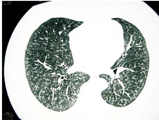
Figure 1. Computed tomography scan of the head, presenting recurrent meningioma in the left temporal lobe

Simple radiogram of the thorax presented diffuse reticulonodular interstitial infiltrate. High-resolution computed tomography of the thorax (Figure 2) revealed micronodules disseminated through both lungs. Laboratory exams were normal. Pulmonary function evaluation presented the following values (and percents of predicted): forced vital capacity of 2.0 L (86%), forced expiratory volume in the first second of 1.62 L (98%), total lung capacity of 3.34 L (87%), current volume of 1.10 L (73%) and diffusing capacity for carbon monoxide of 10.18 mL/min (61%). Fiberoptic bronchoscopy with bronchiolar lavage and transbronchial biopsy was conducted, with no definitive diagnosis. The patient was then submitted to open-lung biopsy, in which wedge fragments were taken from the medial lobe and lower right lobe. The anatomopathological results showed multiple foci of interstitial proliferation of fusiform and oval cells of meningothelial aspect (Figure 3). This result