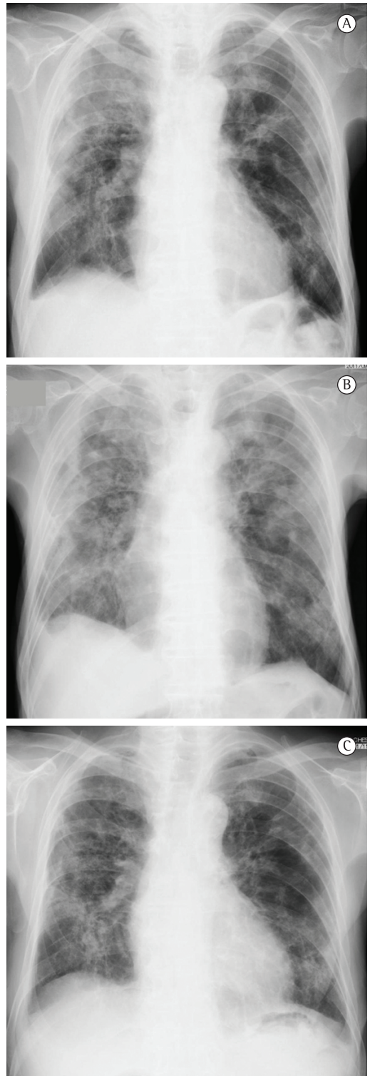
Figure 1 – Chest X-rays showing multiple ground-glass attenuation at admission (in A); just after the family's visit (in B), when the symptoms all worsened; and two months after the treatment with glucocorticoids and sulfamethoxazole-trimethoprim (in C), when the symptoms had improved.

One week later, however, the patient returned to the hospital due to recurrent dry cough and dyspnea and was finally suspected to have hypersensitivity pneumonitis caused by his living environment. An in-depth history demonstrated that he had been raising approximately twenty chickens for 20 years. He had not noticed any respiratory symptoms at all until those series of episodes. He promptly recovered without any treatment after that last admission; his home had been scheduled to be rebuilt at that time. Consequently, he decided to stay at the hospital to avoid any exposure to the chickens or other antigens until the completion of the home renovation. However, the family of the patient unexpectedly came to the hospital to see him just after the chicken shed had been cleaned