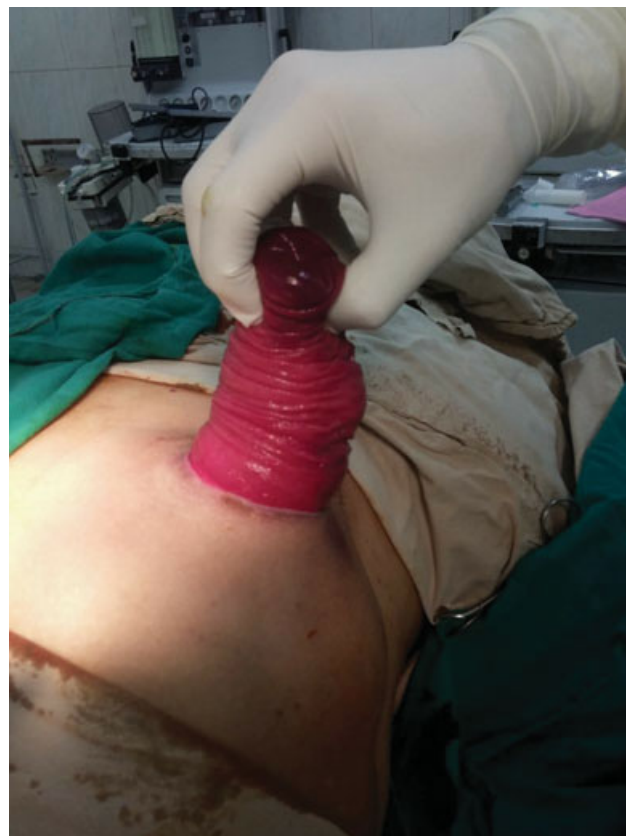
Fig. 1 Assessment of the prolapsed end colostomy (descending colon).

The surgery was performed under general anesthesia. After prepping and draping the patients, we started a round incision at ~ 1.5 cm to 2 cm distal to the mucocutaneous junction, through the outer cylinder of the prolapsed