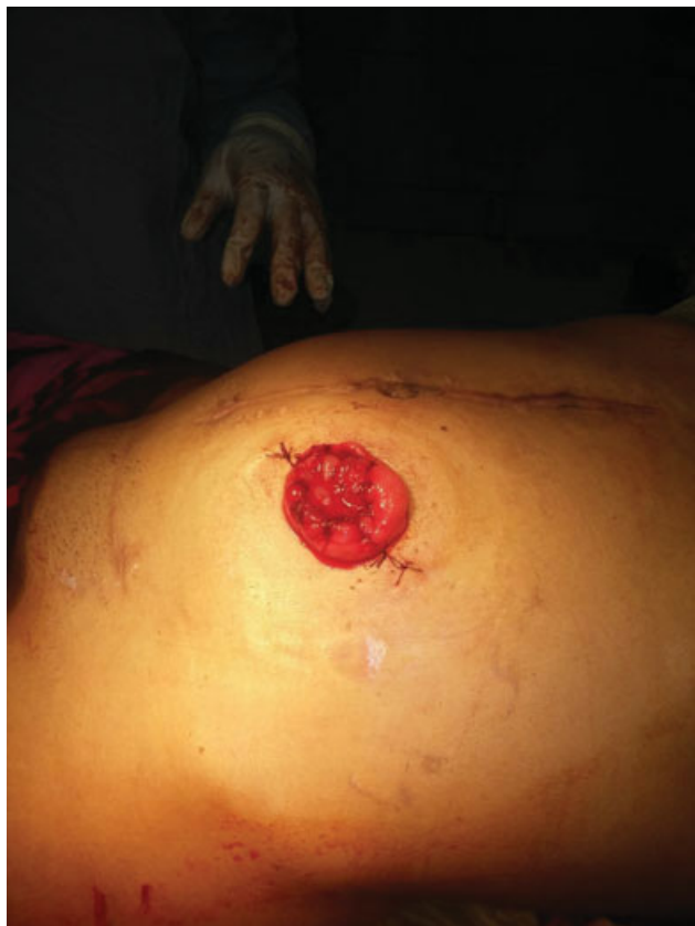
Fig. 4 Anastomosis of the one-layer colocolostomy.

first experience of management of complicated prolapsed stoma using this technique. Moreover, the technique is simple, presents a low risk of operative and postoperative complications, and enables an early recovery, with a lower risk of recurrence during the first 6 months after the repair. We used the hand-sewn Altemeier technique, which saved the costs of using staples.