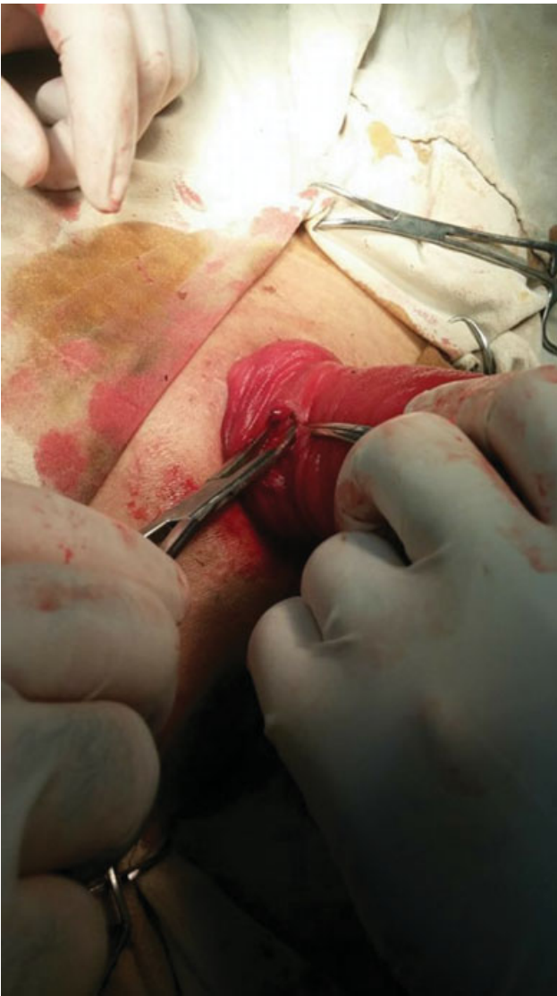
Fig. 2 Line of dissection to separate the outer and inner tubes.