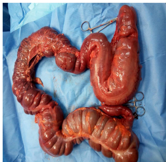
Fig. 2 – Total colectomy.

Biopsy results: 1, 2 and 3 mucosal fragments with exacerbated chronic inflammation. Absence of myenteric plexus in all samples.