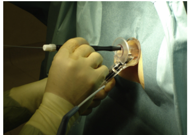
Fig. 3 – Arterial obliteration using 980 nm LASER fiber optics.

None of the surgeries required the use of anesthesia. The mean surgical time was 9.9 min, ranging from 7 to 19 min. The mean number of branches of the superior rectal artery that were obliterated was 10.1 arterioles (7–12). Only 2 patients were anxious in the preoperative period and we chose to