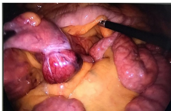
Fig. 2 – Laparoscopic image of the stromal lesion located in the first jejunal portion.

the patient remains in follow-up, showing good progress to date.