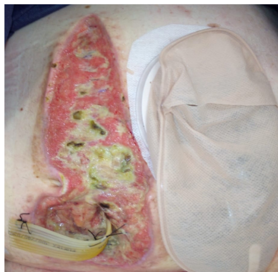
Fig. 1 – Photo demonstrating drainage of abscess secondary to rectal stump leak via insertion of a corrugated drain through the lower aspect of laparotomy wound.

A 68-year-old man underwent an emergency Hartmann's procedure for management of a retroperitoneal abscess sec-