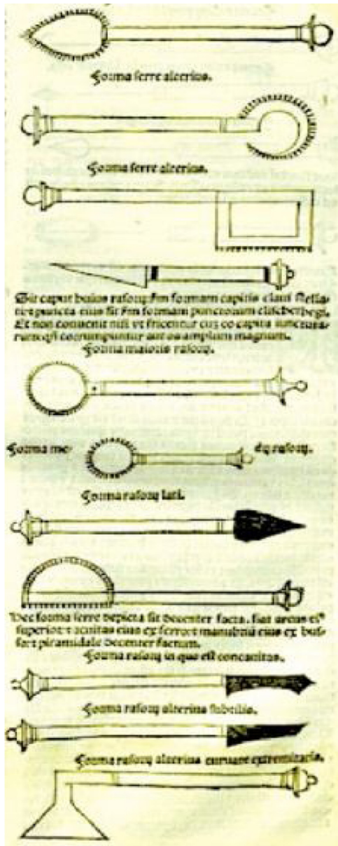
Fig. 2 – Surgical instruments devised or utilized by Albucasis: 30th volume of Al-Tasrif.

wound or it should be cauterized, followed by using proper medicines and lotions until the wound heals completely. If hemorrhoids did not prolapse, then burning enema should be used to help the patient for prolapse hemorrhoids.