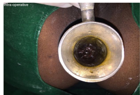
Fig. 8 - After circumferential Kshara application.