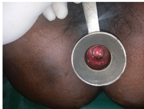
Fig. 9 – (AT) Proctoscopy examination.