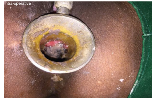
Fig. 6 - Kshara application.