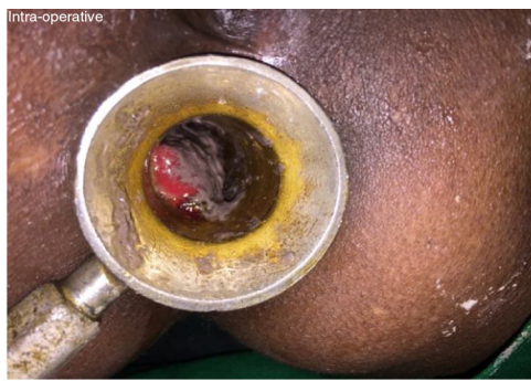
Fig. 4 - Kshara application.