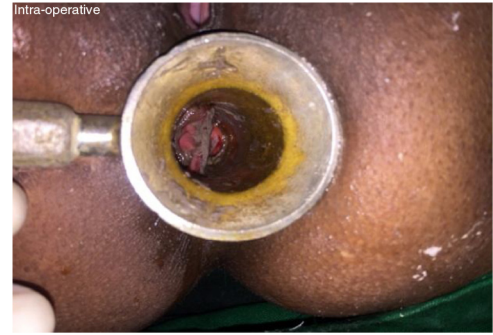
Fig. 5 - Kshara application.