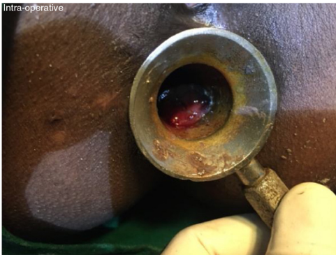
Fig. 3 - Kshara application.