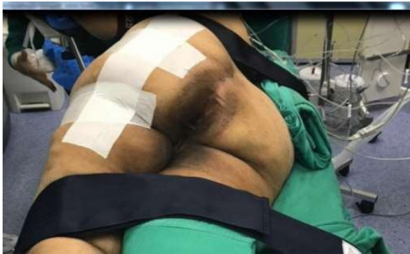
Fig. 3 – Patient positioning in the right-side decubitus, almost in the prone position.

Work-up included 3D endorectal ultrasonography and magnetic resonance imaging, which demonstrated the lesion to be uT1uN0. The patient was counseled about surgical options – local excision versus low anterior resection. Due to the cardiologic condition, the patient was elected to proceed with local excision with robotic transanal surgery.