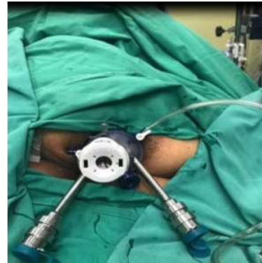
Fig. 4 – Robotic docking and port placement.