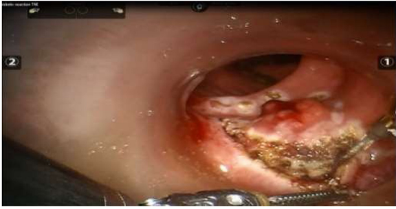
Fig. 6 – Tumor removal.

closed using the Vicryl running suture technique with the robotic arms.