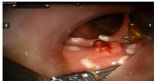
Fig. 5 – Circumferential marking for adequate excision of the tumor.

flation. Subsequently, a 12-mm laparoscopic trocar with the robotic camera was placed in the superior midline, two 8-mm robotic working ports in the left inferior and right inferior posterior position and one 5-mm laparoscopic trocar in the inferior midline position (Fig. 4). The robot was then docked from the right side of the patient with the base of the robot positioned at a 45° angle with the bed (Fig. 4). Na 12-mm robotic camera with 30° upward positioning was introduced in the superior middle trocar, a robotic hook with monopolar energy followed by a needle holder in the right working port, a robotic Maryland dissector with bipolar energy followed by a fenestrated grasper in the left working port, and a standard laparoscopic suction device in the inferior midline position.