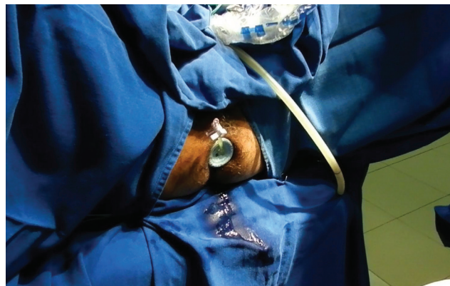
Figure 2. Introdução do dispositivo SILS