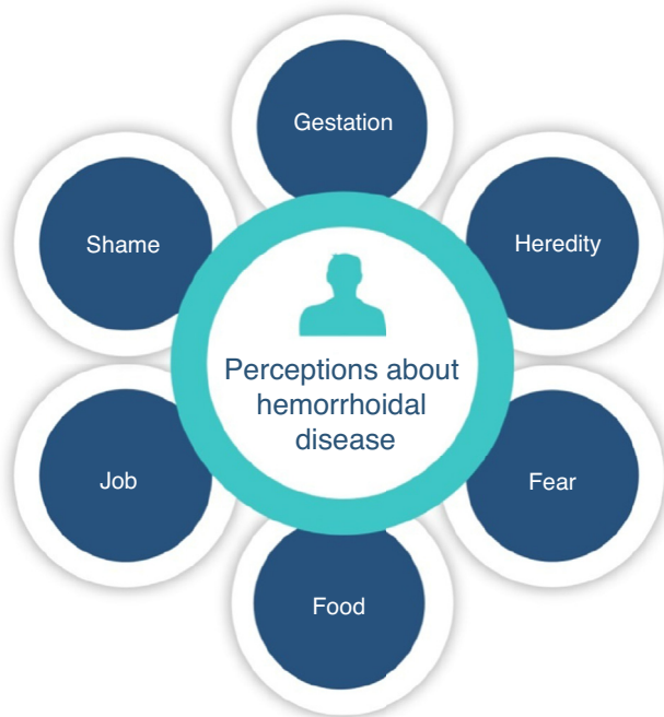
Fig. 3 – Perception of the patient about hemorrhoidal disease.

a limiting cause for achieving a plan of immanence, freeing patients from disease and decreasing its potency. 19,20