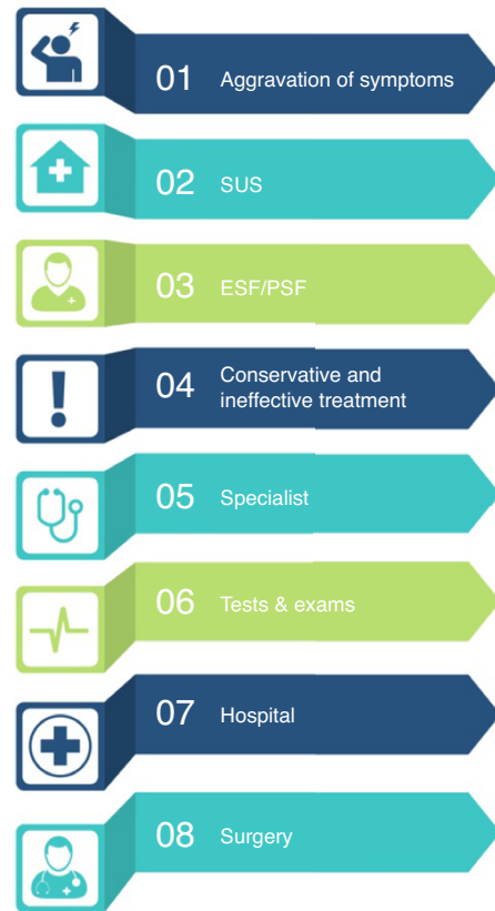
Fig. 4 – Trajectory of patients submitted to hemorrhoidectomy.

“I was lucky because it seems that some person was quitting the procedure; thus, they sent me over, in the place of that person.” (E9)