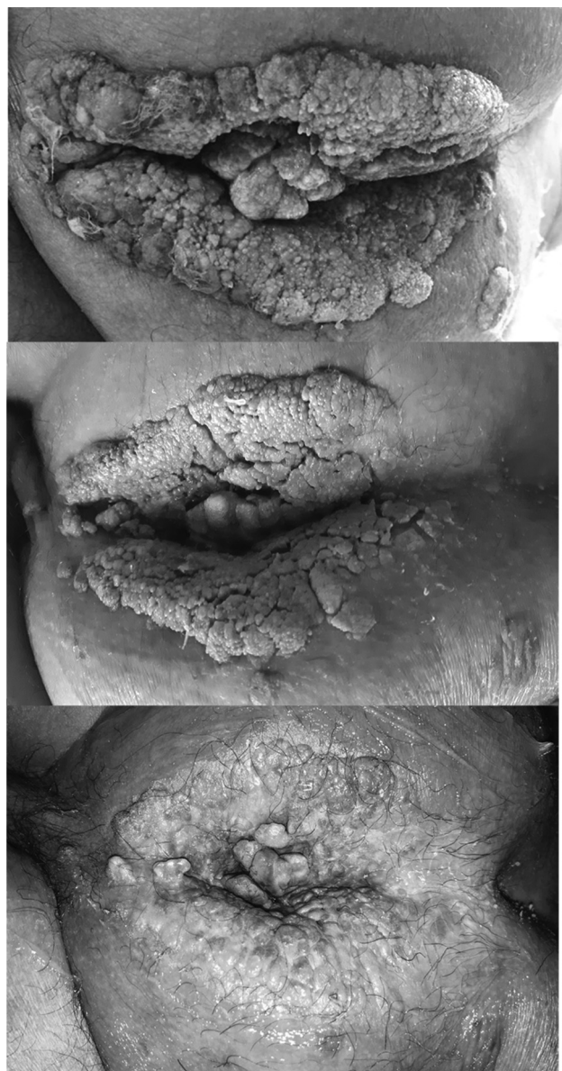
Fig. 2 Partial response.