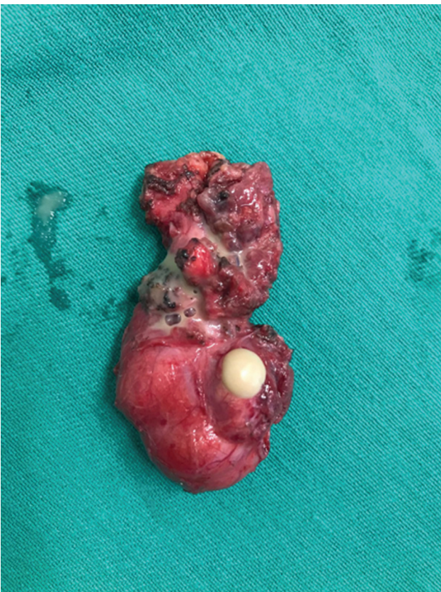
Fig. 2 Cystic lesion – incidence 1.