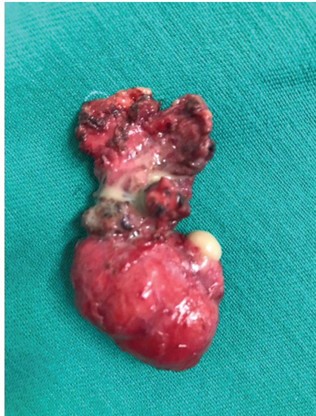
Fig. 3 Cystic lesion – incidence 2.

Although cases of tailgut cyst are mostly asymptomatic, due to contact with different structures located in the retrorectal space, their clinical manifestations can mimic those of different urological, neurological, or gastrointestinal pathologies. 3