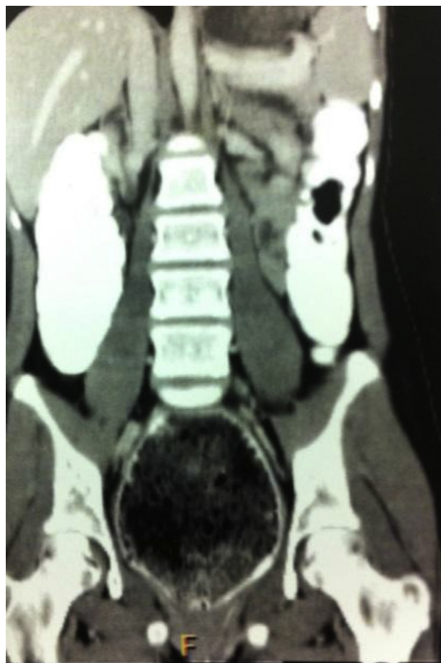
Fig. 2 – Computed tomography (coronal plane) showing rectal fecal impaction with megarectum.

Serology for Chagas' disease was carried out in order to exclude a diagnosis of Chagas' Disease megacolon, with negative result. Thus, the diagnosis of HD was confirmed. Surgical treatment was performed laparoscopically, according to Duhamel-Haddad technique modified with protective