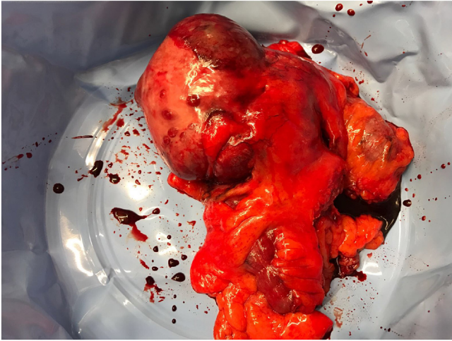
Fig. 2 – Surgical specimen: en block resection, right colon with fibroid tumour anterior view.