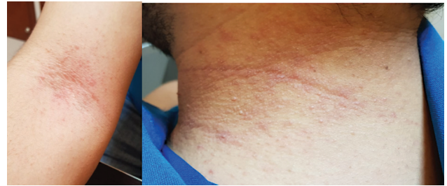
Image 3 Erythematous plaques with fine, pruritic scaling on the neck (right) and ulnar fossae (left).

When the patient returned for a check-up after 3 weeks, he reported not having ingested irritants, fats, and drinking more than 2L of water per day. The physical examination revealed localized dermatosis of the perianal skin characterized by erythematous skin with fine scales. As there was no improvement with the treatment, we decided to take an