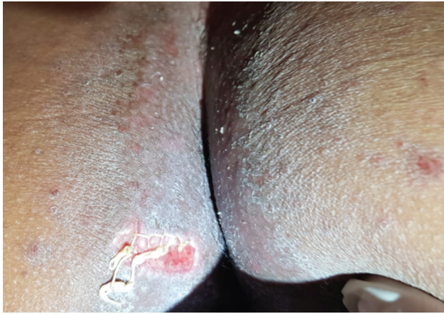
Image 1 Perianal dermatosis characterized by erythematous plaques with fine scaling.