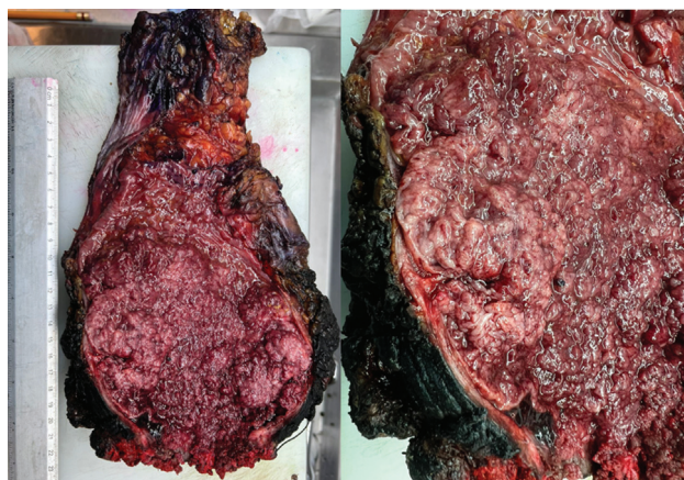
Fig. 3 Product of intersphincteric resection. Macroscopic image of the rectal tumor.

in the lower, middle, and upper rectum, located 4.1 cm from the anal margin, with involvement of all layers of the rectal wall, with diameters in the sagittal plane of 17.1 × 7.5 cm (► Figures 1 and 2 ).