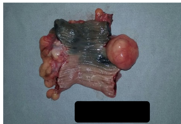
Fig. 2 – Surgical specimen.