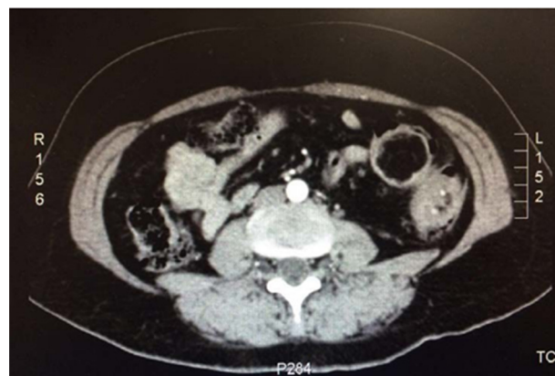
Fig. 1 – Abdominal CT with left colon thickening.