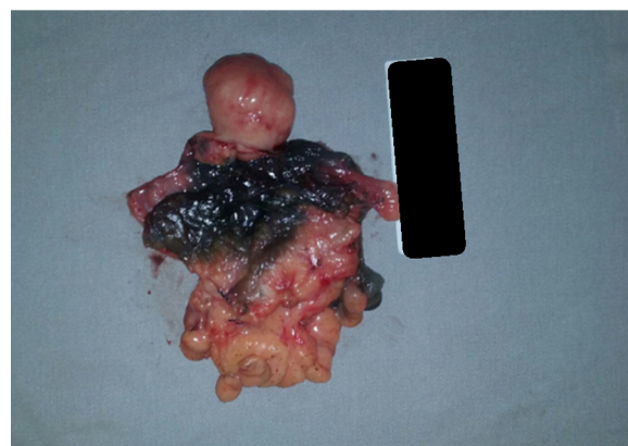
Fig. 3 – Surgical specimen.