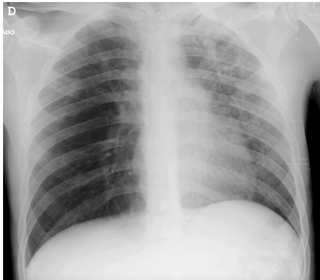
Fig. 1 Rounded hyper-transparency in the upper third of the left lung on chest radiography.

resolution of complications in majority of patients, avoiding in the morbidity of multiple surgeries. 6