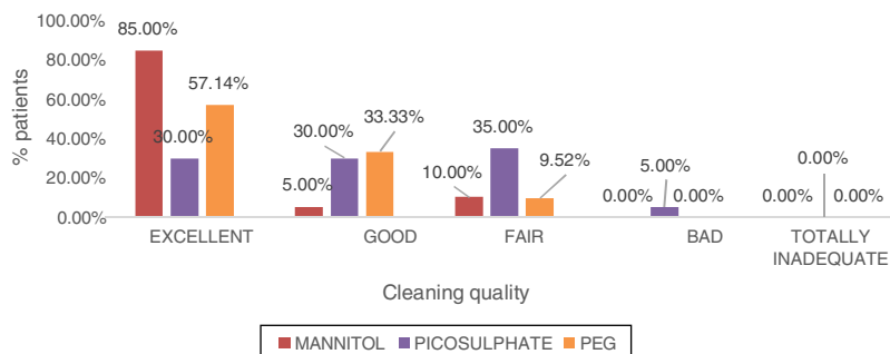
Fig. 1 – Quality of colonic cleaning.

The amount of water ingested in the 10% mannitol group was considered bearable by 9 (45.00%) participants, relatively bearable by 8 (40.00%) patients, and poorly bearable by 3 (15.00%) patients. For those who received macrogol, the amount was bearable for 13 (61.90%) participants, relatively bearable for 2 (9.52%), and poorly bearable for 6 (28.57%). In the group receiving sodium picosulphate, the amount of water was considered to be bearable, relatively bearable, and poorly bearable for 16 (80.00%), 2 (10.00%), and 2 (10.00%) participants, respectively. The difference was considered statistically significant ( p = 0.03 ).