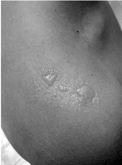
Figure 1 - Sunburn with blistering in children: an example of susceptibility to skin cancer in the coming years

appearance on the skin is fast and continues in childhood, from ages 3 to 15, getting in adulthood to an average of 20 to 30 melanocytic nevi in the whole skin. 18 Boys and girls have the same number of nevi but their allotment varies: boys have more nevi in the torso, while girls have more in the limbs. 18