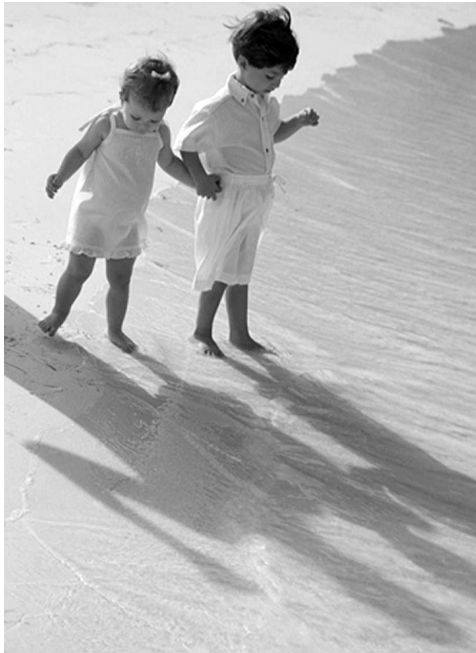
Figure 2 - "Shadow rule": best times for outdoor exposure, as indicated by the shadow of the children in relation to their height.

Topical photoprotectors and topical sunscreens are substances that absorb and filter UVR, dispersing and reflecting radiation. 29 Most sunscreens approved by the