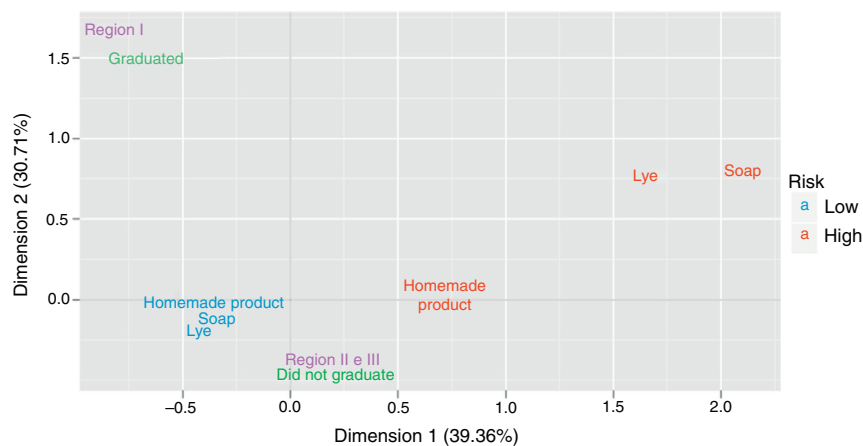
Figure 2 Associations between regions of the Federal District and educational level with risk practices (soap making, use of lye, and illicit products).