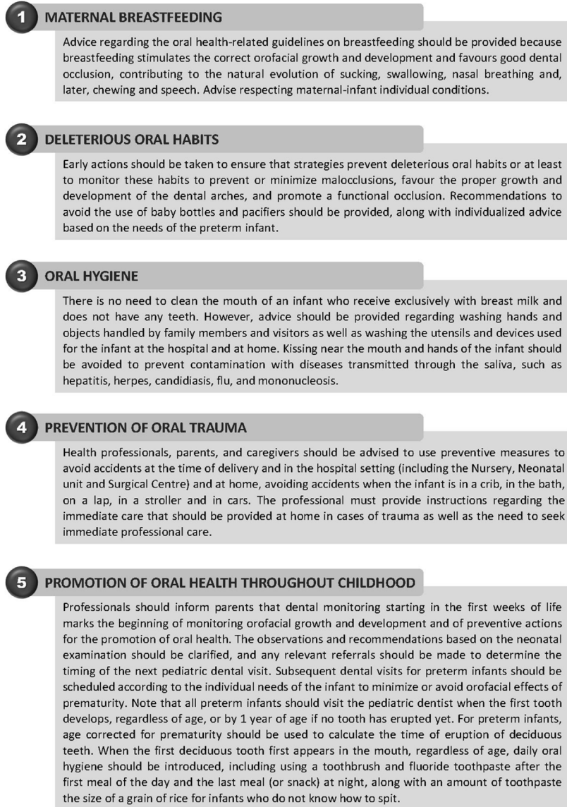
Figure 3 Neonatal oral health promotion guidelines.

studies by Lian et al. 26 that analysed cephalometric tracings on the teleradiographs of individuals aged between 6 and 14 years with obstructive sleep apnoea who were born preterm and at term and stated that preterm infants have a different craniofacial morphology compared to full-term infants, suggesting that preterm infants had a longer vertical mandibular length, indicating a dolichocephalic facial profile (long face). Paulsson and Bondemark, 27 who also evaluated cephalometric tracings, reported that several craniofacial parameters differ significantly among children born preterm and at term. On the other hand, regarding dental occlusion in preterm infants, Seow, 28 in his review on the effects of preterm birth on oral growth and development, reported a high prevalence of class II occlusion, in which the maxilla is found in a protruding position relative to the mandible (horizontal overlap). However, Harila