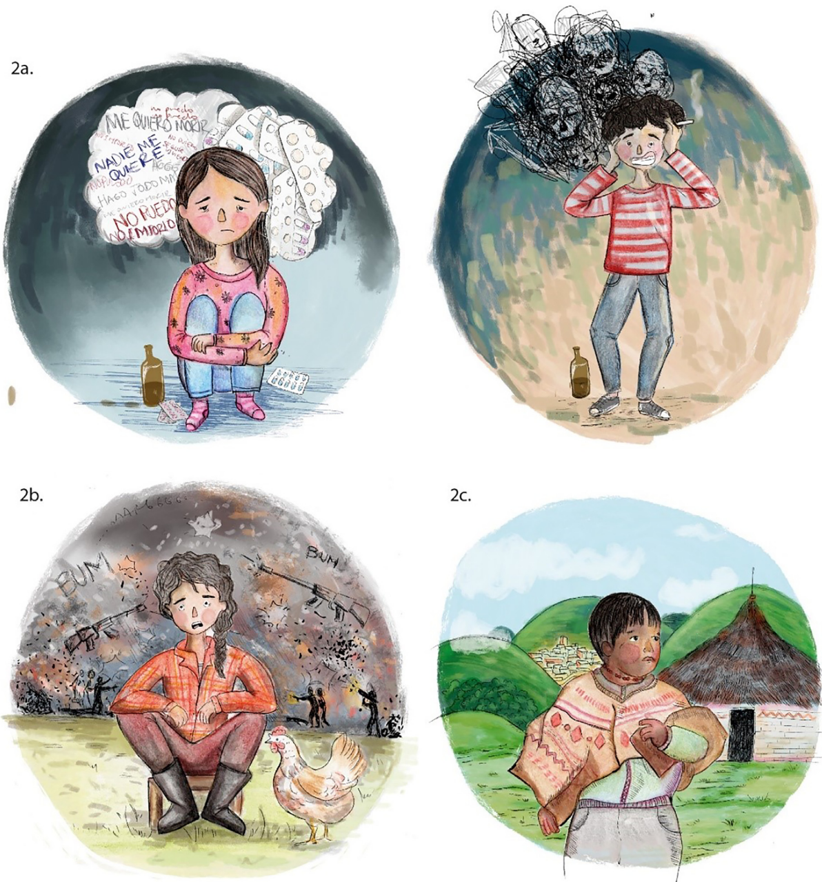
Figure 2 Profiles of the Suicide Attempt in children and adolescents. (2a) “Classic” Profile. (2b) “Related to the armed conflict”. (2c) “Ethnic” Profile.