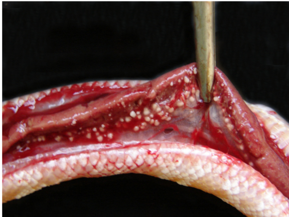
Fig. 1 Mycobacteriosis in Python molurus . Liver with whitish, multifocal nodules, randomly spread, indicating a granulomatous inflammatory process

Due to nonspecific macroscopic lesions observed at necropsy and granulomatous inflammation generally associated with infectious agents resistant to phagocytosis, mycobacterial infection was included in the differential diagnosis. Bacilli, stained positively by Ziehl-Neelsen, suggested the presence of Mycobacterium infection [15].