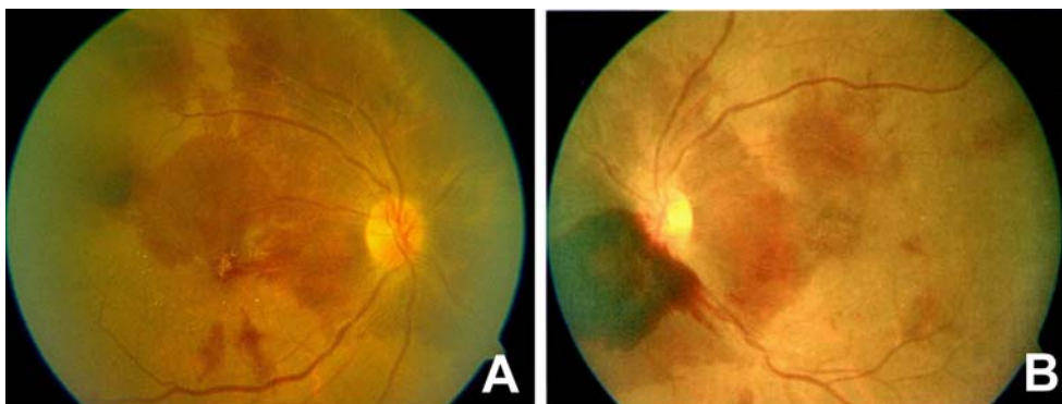
Figure 3. Right (A) and left (B) fundus two months after initial examination. Note the persistent retinal and subretinal hemorrhages in both eyes.