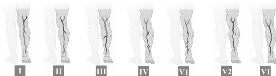
Figure 2. Patterns of reflux in the small saphenous vein: I) Medial junction reflux pattern; II) Proximal reflux pattern; III) Distal reflux pattern; IV) Segmental reflux pattern; V1) Multisegmental pattern without reflux at SPJ; V2) Multisegmental pattern with reflux at SPJ; VI) Diffuse reflux pattern.