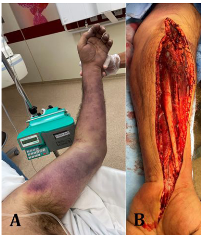
Figure 3. Male patient, 61 years old, with controlled hypertension, hospitalized due to edema and pain in the left upper limb ( A ), tested positive for COVID-19. Color Doppler ultrasound revealed extensive arterial thrombosis of the left upper limb, absence of flow in radial and ulnar arteries, and palmar arch. The examination showed evidence of forearm compartment syndrome. The patient underwent decompressive fasciotomy ( B ) and arterial Fogarty catheter thrombectomy. He progressed well and was discharged on oral anticoagulants.

in radial and ulnar arteries and the palmar arch. He underwent decompressive fasciotomy and Fogarty catheter thrombectomy, recovered well and was discharged on oral anticoagulants.