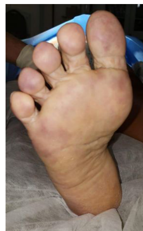
Figure 1. Female patient, 62 years old, hospitalized due to COVID-19, developed an ischemic plaque and possible infectious spot in the left heel, and erythrocyanosis of the forefoot. She was given clinical treatment with full IV heparinization and venous prostaglandin for three weeks. Her clinical condition improved, and she was discharged after 30 days.

This correlation in critically ill patients between infectious complications and inflammatory activation, with systemic activation of coagulation leading to DIC, is multifactorial. Microorganisms and their components induce expression of several substances, including tissue factor in monocytes and macrophages, which bind to immune cell receptors. Inflammatory activation of the host also results in increased production of proinflammatory cytokines with pleiotropic effects, including activation of coagulation, which can lead to consumption coagulopathy. 8,14